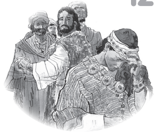
The Rich Young Ruler

King Jesus Treats Serve goldfish crackers and marshmallows.