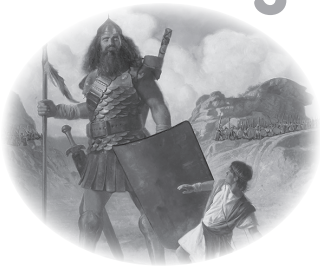
David and Goliath 1 Samuel 17:31–50

Sticks and Stones Serve drinks, veggie or pretzel sticks, and fruit chips. Decorate straws with green ribbons or tape to use in the drinks.