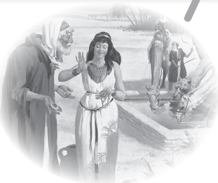
Isaac and Rebekah Genesis 24

Review the Bible truth in the lesson. Sing songs and pray. Send information and completed projects home to families.