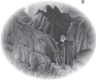
God Gives the Law Exodus 19–20

Review the Bible truth in the lesson. Sing songs and pray. Send information and completed projects home to families.