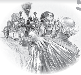
Joseph Cares for Jacob Genesis 46:29–30; 47:7–12

Review the Bible truth in the lesson. Sing songs and pray. Send information and completed projects home to families.