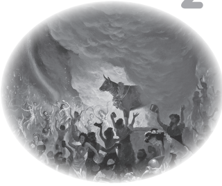
The Golden Calf Exodus 32:1–20

Fit for a King Cut bread with heart-shaped cookie cutter. Add spreads such as cream cheese, pressurized cheese, and jelly to the bread.