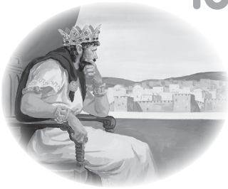
Ahab Covets Naboth's Vineyard

Review the Bible truth in the lesson. Sing songs and pray. Send information and completed projects home to families.