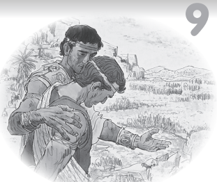
David and Jonathan 1 Samuel 18:1–5; 19:1–7

Review the Bible truth in the lesson. Sing songs and pray. Send information and completed projects home to families.