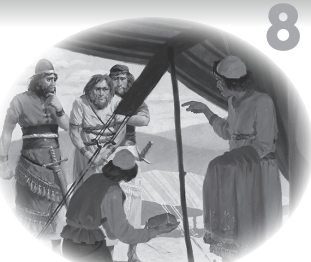
Achan's Sin Joshua 7:10–26

Review the Bible truth in the lesson. Sing songs and pray. Send information and completed projects home to families.