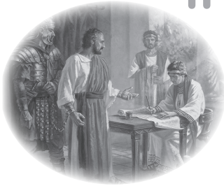
Paul and Philemon

Castle of the Holy Ten Commandments Serve graham wafers, thin pretzel sticks, and tube frosting to make castles and drawbridges.